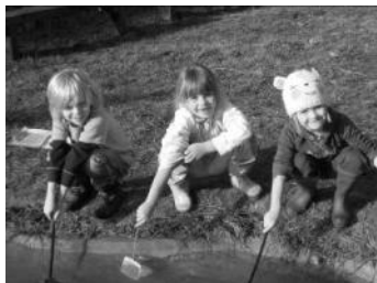
Above and below: Finding out 'How Nature Works'