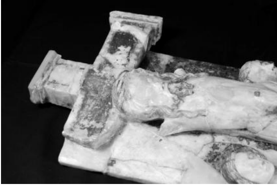
The Layston alabaster

report regarding all this, which we bought for £5. This itemised all the work and commented on the woodworm in the pews and the holes in the roof.