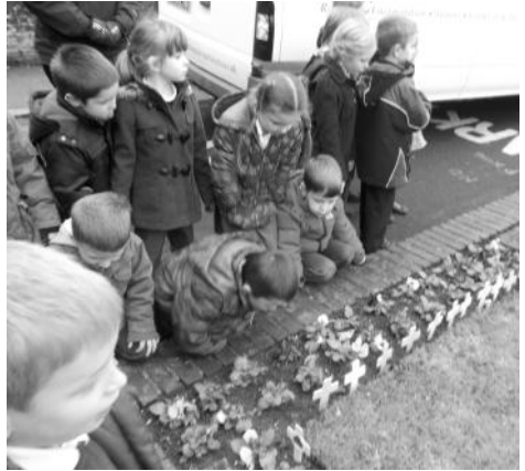
KS1 children at the War Memorial

If you would like to know more about our school please visit our website www.millfield.herts.sch.uk or contact the school on 01763 271717.