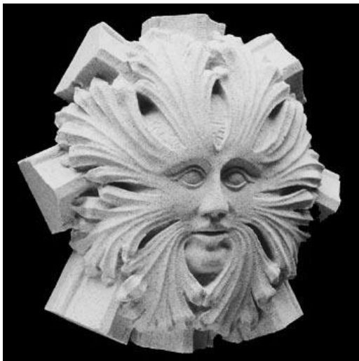
The Green Man in Canterbury Cathedral

So I've never run into green men before, but a bit of hunting around in the internet is a dangerous thing. It comes to pass that the tradition of a green men actually goes back many years into pagan times – as far back as the 2nd century where you can find carvings of a man's head with leaves growing out of it. They started as stone and wooden carvings on memorials to rich citizens, but by the 4th century they had made their way onto Christian tombs. By the 6th century they had managed to enter into church buildings – most notably by Bishop Nicetius of Trier who took some of these carvings and included them in his cathedral there. For hundreds of years these carvings were on prominent view, until the 11th century when, in a process of restoration, they were hidden behind brickwork. These days it's rare to find green men prominently displayed in churches (although I'm told one can be found in the screen at Kinnersley Church in Herefordshire), but they are often hiding. They are in the undercroft at Wells Cathedral and in the Black Princes Chantry at Canterbury Cathedral. In fact normally there's one in every cathedral somewhere.